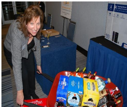
Wheelbarrow of Booze