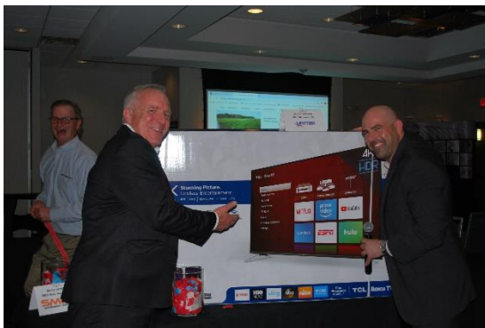
Flat Screen TV